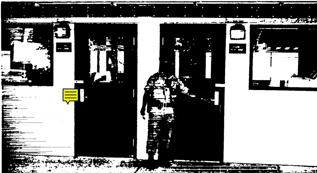
Paul Fresquez stands beside new TA-55 portal.