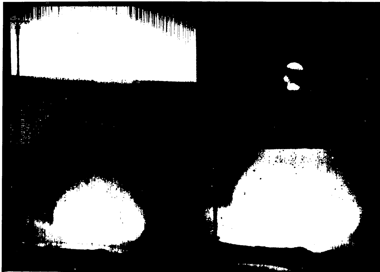
Figure 3. Early development of the upper atmospheric shock as seen from Haleakala (~9000 ft above sea level) on Maui Island.