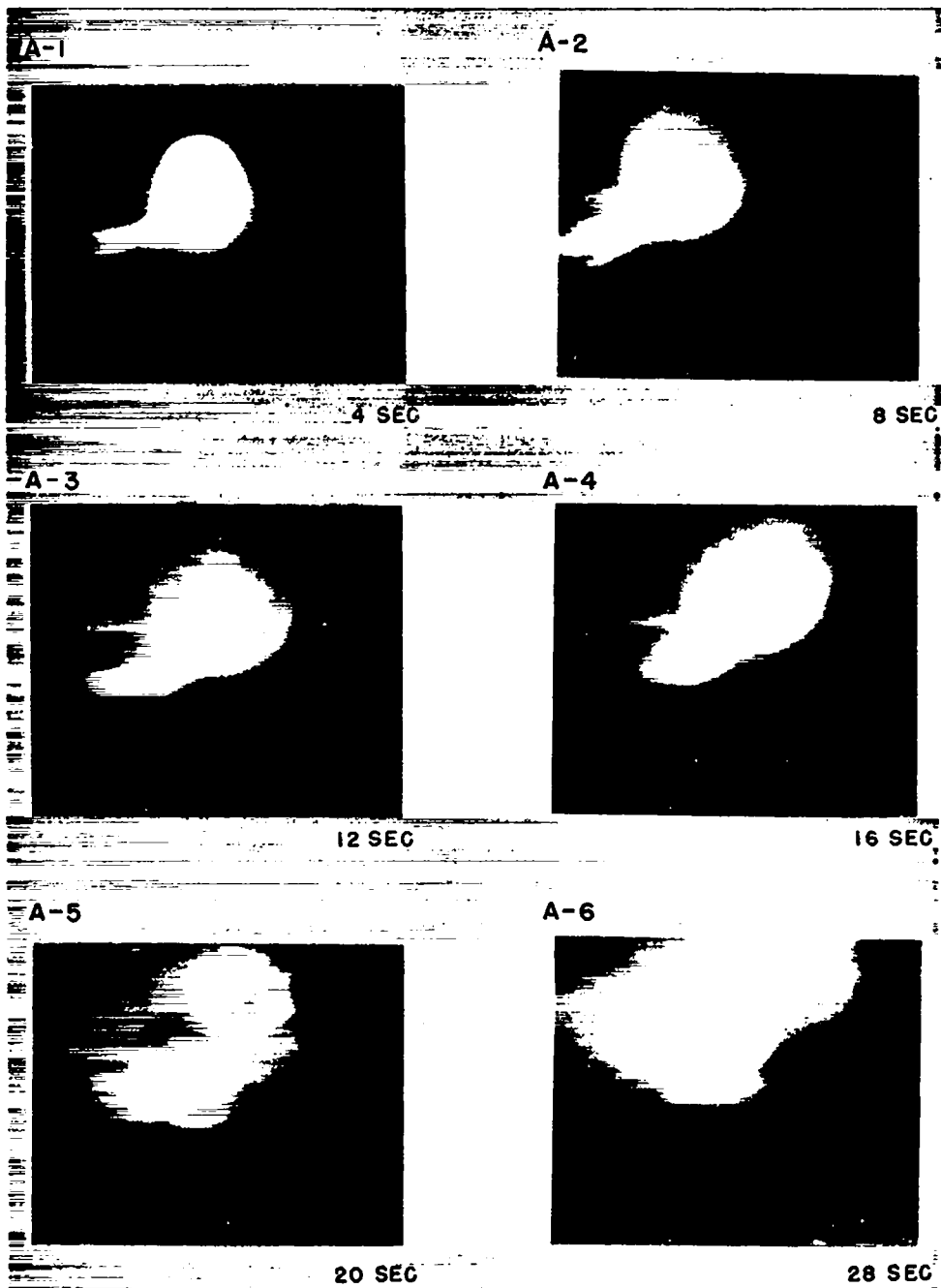
Figure 1. Late phases of Teak fireball and formation of northern branch of aurora as viewed from aircraft flying NW of explosion. Horizontal diameter of fireball at +3.5 sec was ~30 km.