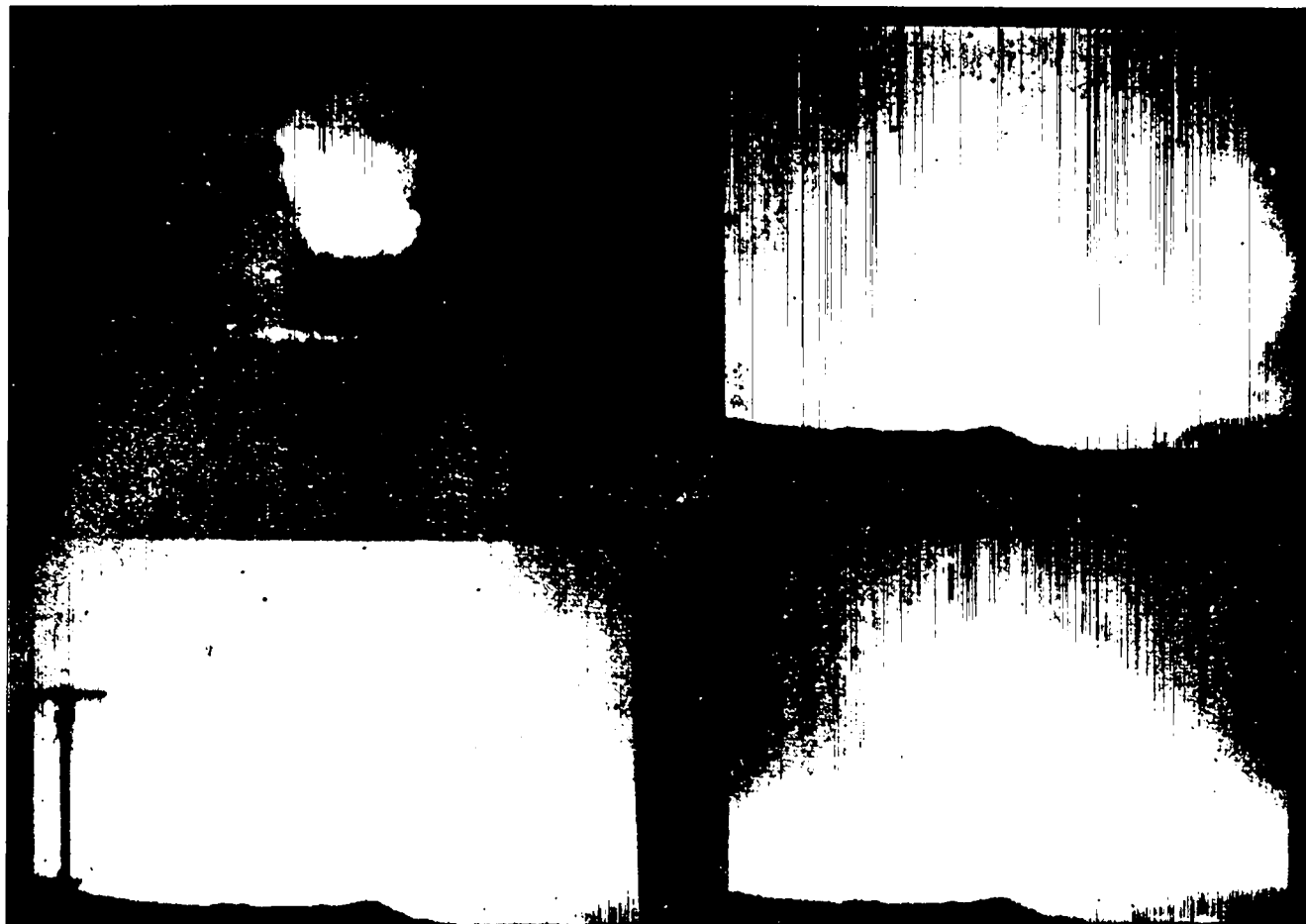
Figure 4. Late development of upper atmospheric shock and location of bomb debris, as seen from Haleakala.