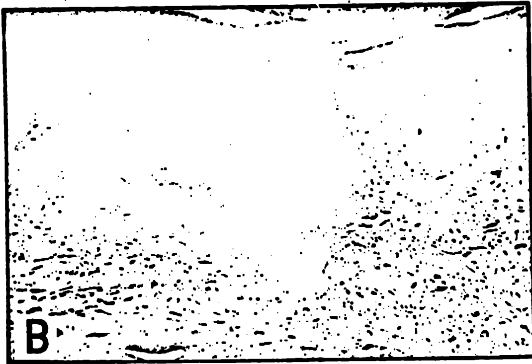
Radiation Research —G. R. Richmond Fig. 3