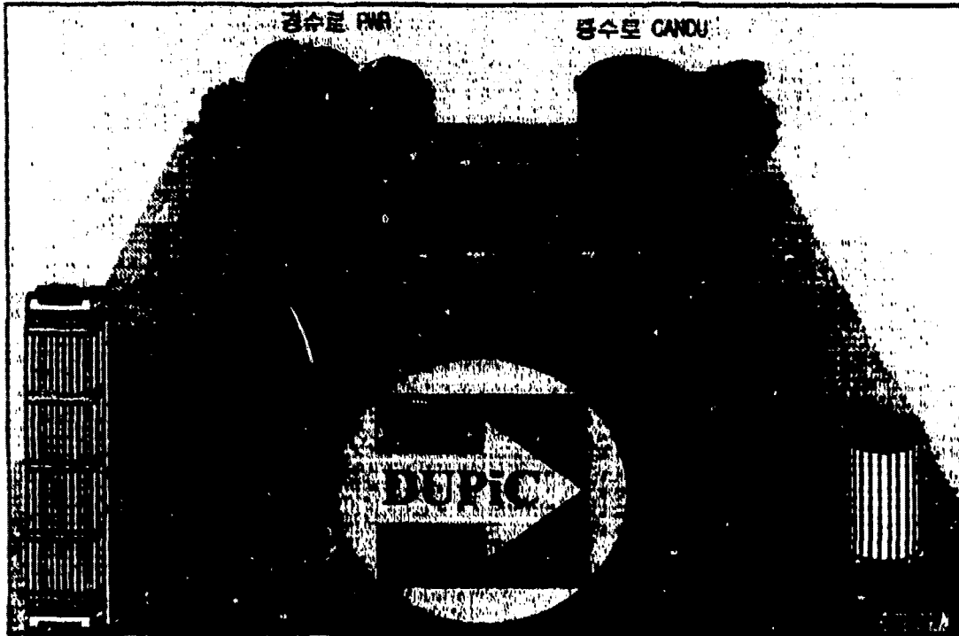
Fig. 2. The diagram illustrates the fuel flow in the DUPIC process from the PWR spent fuel assemblies, through the mechanical refabrication process, to the CANDU fuel bundles containing the highly radioactive fuel.