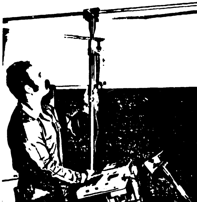
Fig. 2. Simulated uranium holdup measurement.

Two major applications, which use external control, are now under development at Los Alamos. One development will soon be tested at the Oak Ridge Y-12 plant. This is a portable cart with a PMCA, a HX-20, and a complement of NaI detectors. It will be used to measure uranium holdup in high-enriched powder transfer lines. Figure 2 shows a technician placing one of the detectors over a simulated transfer pipe. The HX-20 controls data acquisition and analysis. Results are printed on the HX-20's internal printer. The use of this system is mainly for inventory and it may have limited use in process control.