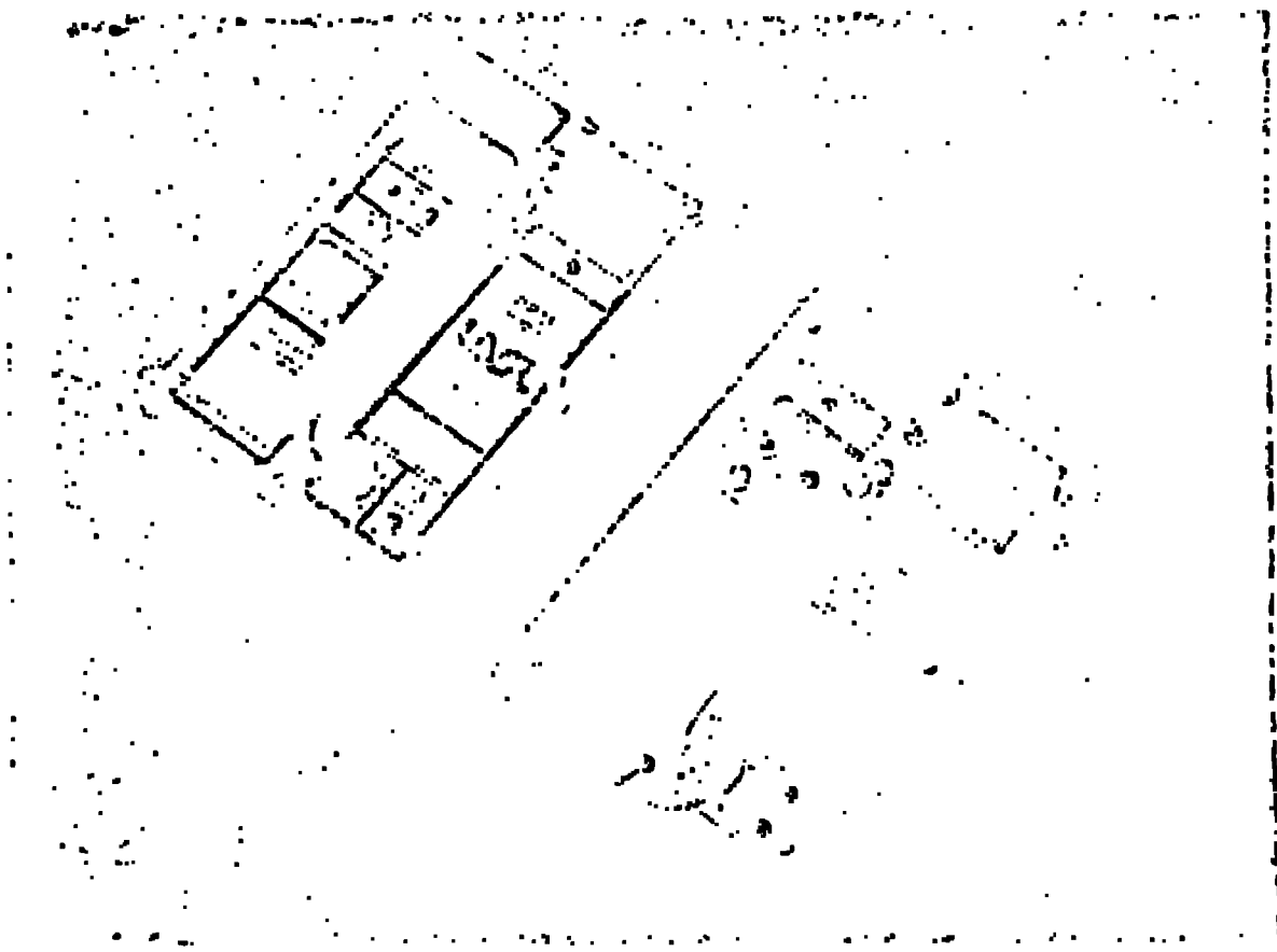
Fig. 2. The PVM and DRM Hand-Held Monitors.

A third vehicle monitor that has been in use at IASL and other DOE installations is the hand-held monitor. 6) This monitor was developed at IASL Q-2 to provide an instrument capable of detecting small changes in gamma radiation count rate without requiring a great deal of operator training and experience. To this end, the package contains logic circuitry in addition to the usual battery-operated power supplies, signal conditioning electronics, and NaI scintillation detectors. Figure 2 shows the hand-held monitors in two forms. The original unit, which we call a personnel-vehicle monitor (PVM), has a logic circuit that calculates an alarm level that is a mean background count plus a selectable fraction of the background. For instance, a commonly used selection is to alarm when the count in a count interval exceeds 1.4 times the mean background. The second instrument, the delta rate monitor (DRM) that is just now being