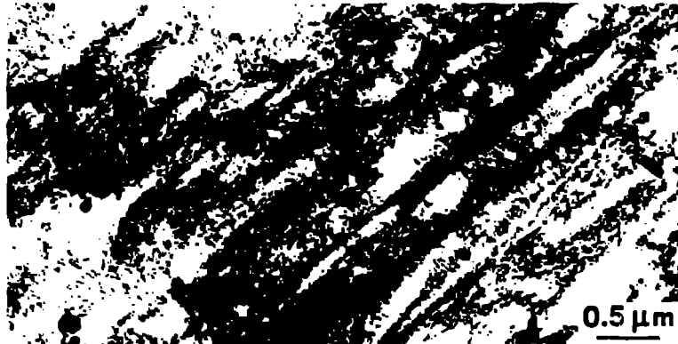
FIGURE 3 TEM micrograph of 6061-T6 Al shocked to 13 GPa showing microbands.