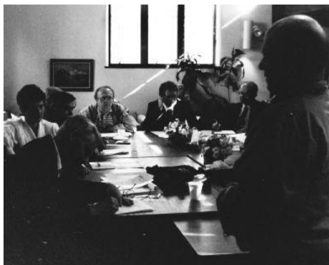
Russian-American meeting in University House in Los Alamos.