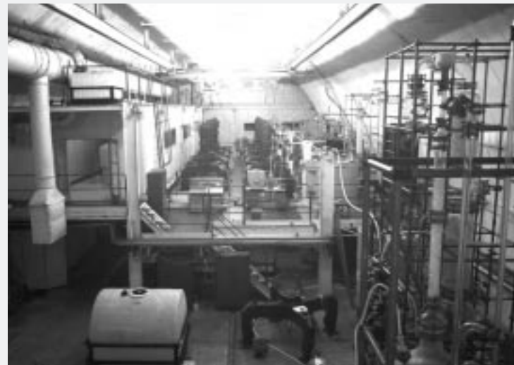
The tops of eight greenish tanks poke through the elevated floor of the Baksan Neutrino Observatory. The squat tanks contain a total of 57 tons of trapure gallium. Heating the tanks to about 30 degrees centigrade keeps the gallium in liquid form. Once or twice a day, one of the hundred trillion or so solar neutrinos that pass through the tanks each second interacts with the gallium and produces an unstable germanium atom. These unstable atoms are extracted from the tanks once a month. The red motors seen perched above each tank are used to rapidly stir the liquid gallium during the extraction runs. The equipment seen in the foreground handles the chemicals used for the extraction. The red room to the left of the picture houses all the electronics and control systems used in the experiment.

We hope that SAGE can continue measurements for a few more years. We are also investigating the possibility of converting gallium metal into gallium arsenide, which would enable construction of a real-time electronic detector for the entire solar-neutrino spectrum with very good energy resolution (a few kilo-electron-volts). The feasibility of such a detector still needs to be researched. However, the fate of the gallium, which remains the property of the Russian government, is now in doubt. Recently, an edict was issued requiring that the Institute for Nuclear Research of the Russian Academy of Sciences, which oversees the Baksan Observatory, return the gallium so that it could be sold and thus help pay salaries for unpaid government workers. While being sympathetic to the plight of the Russian workers, we also feel that, given its extremely high purity and low levels of trace radioactivity, the gallium should be considered a world resource to be invested in future research. We hope the Russian government will reach the same conclusion and explore other means to ease its fiscal crisis. ■