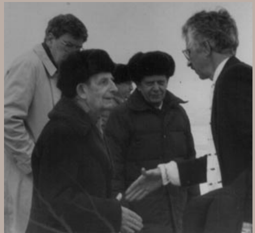
"The visit to Arzamas-16 and Chelyabinsk-70 followed a visit by the Russian institute directors to Los Alamos and Lawrence Livermore national laboratories."